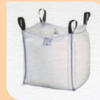
1 ton tote bag