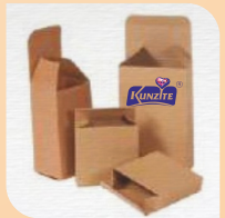
1 kg mono carton