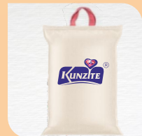
White bleach jute bag