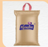
Natural brown jute bag